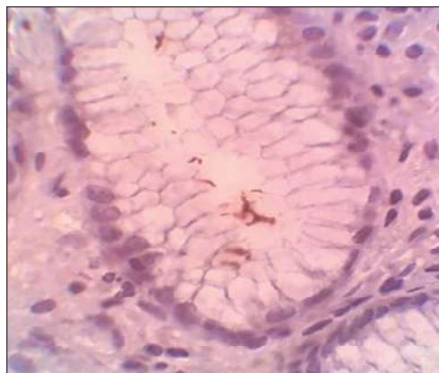
Fig. 1: Gastric pit and glands with mild H. pylori density, IHC x1000

Of the 100 cases 67 cases were positive and 33 cases were negative for H. pylori by IHC (Fig. 1). H. pylori was detectable with H & E stain (Fig. 2) in 58 cases, similarly in 63 cases with modified Giemsa stain (Fig. 3). 9 cases which were negative on H & E stain and 4 cases negative on modified Giemsa stain were found to be positive on IHC. 33 cases were negative in all stains. Sensitivity and specificity of H & E was 86.6% & 100% and modified Giemsa was 94.0% & 100% respectively. Related data is given in Table 1.